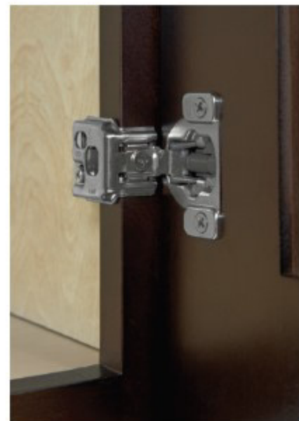
SOFT CLOSE HINGES