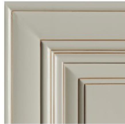
CHARLESTON ANTIQUE WHITE